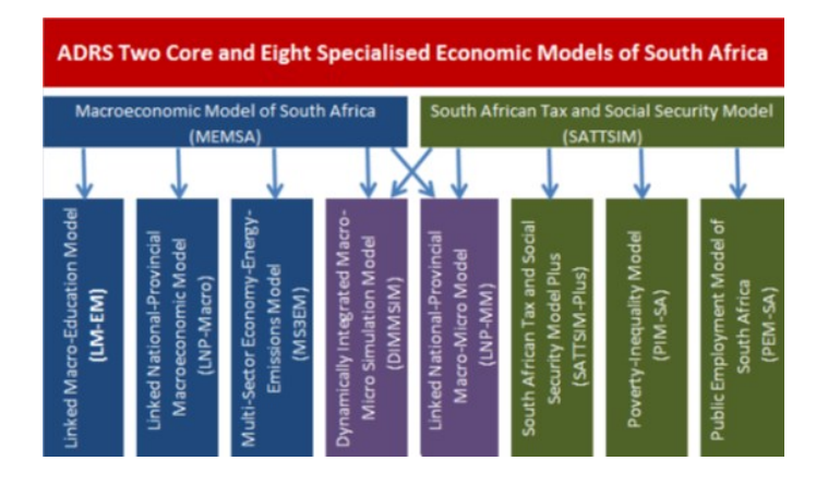
Diagram 3: The ADRS two core and eight specialised economic models in South Africa

A presentation of the Applied Development and Research Solutions (ADRS) multi-sector macroeconomic model was made. This was briefly described as a large multi-sector macro-economic model built as a tool for designing, forecasting, and conducting impact analyses of macro-economic and industry policy scenarios. A diagrammatic representation of the ADRS macro model MEMSA for four specialised models is given below: